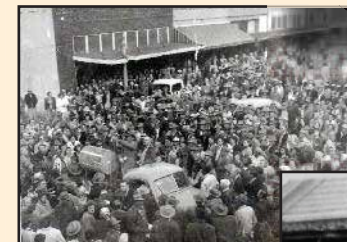
Saturday Drawing Crowd

The county line drawn in 1836 to divide Itawamba and Tishomingo counties in downtown Baldwin exists today as the boundary line for Lee County and Prentiss County, established in 1870. The line also signifies "wet" and "dry" boundaries for alcohol consumption. Some say Baldwin was the first town in Mississippi to adopt prohibition in 1875; and in 1966, Mississippi was the last state to repeal prohibition, allowing each county to decide where the line of legality lies. In Baldwin, the line was literally within the buildings that housed restaurants that served alcohol and some discourse arose when customers moved from their point of purchase in Lee County where alcohol sales were legal, across the room to Prentiss County.