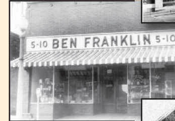
Green Front Store