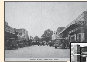
Baldwin Downtown 1940