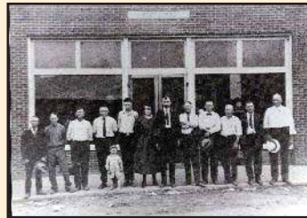
Old Post Office on East Main St.