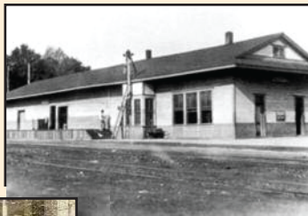
Depot and railroad

settlement of Carrollville, 2 miles northwest of here.