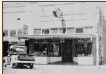
Union Drug Store